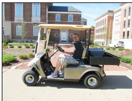
An ECU Libraries' student employee delivers Library Express materials using Dewey the Golf Cart

At the beginning of the fall 2011 semester, Library Express , ECU Libraries' retrieval and delivery service traditionally offered only to faculty and staff, was expanded to serve all Eastern faculty, staff and students—regardless of location. Faculty, staff and students can now request books and other circulating items from the libraries' online catalog and pick them up either at the John Grant Crabbe Main Library or the branch library of their choice. Items are also delivered to regional campus and online students via