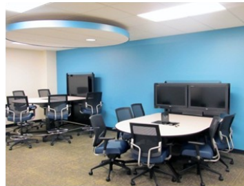
Group work stations in the renovated Justice & Safety Library

Eastern Kentucky University welcomed another great space to campus when the newly renovated Justice & Safety Library reopened on January 9. Part of the larger Stratton Building renovation, the nearly half-million dollar project was generously provided by EKU’s College of Justice & Safety.